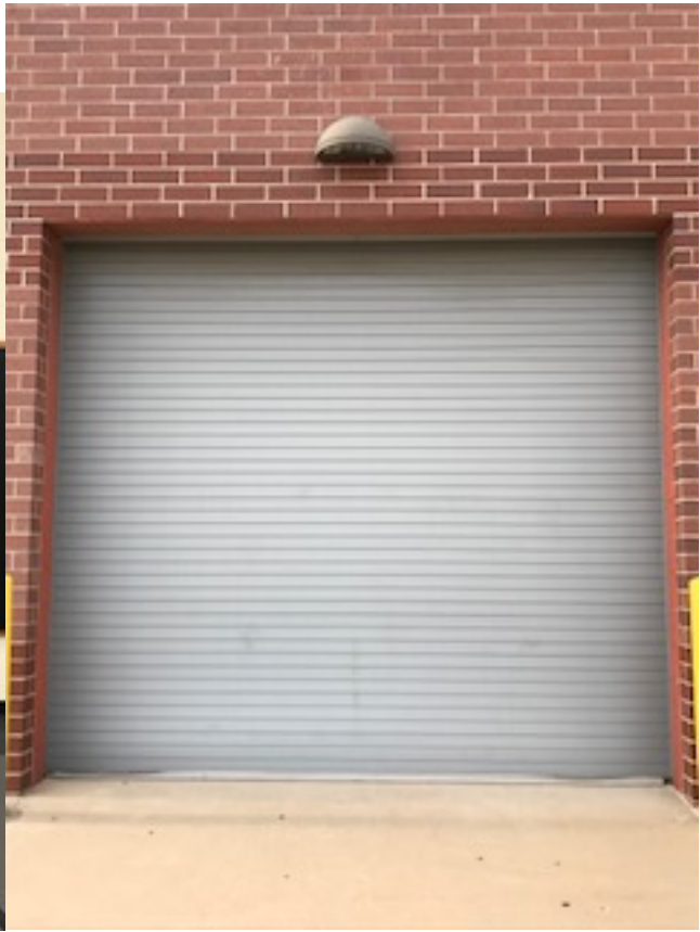
Garage door entrance Height - 126" Width 143"

The above information is being provided to you in order give you the most complete information we currently have on this contest. All information is subject to change either before or during the event by contest personnel based on need.