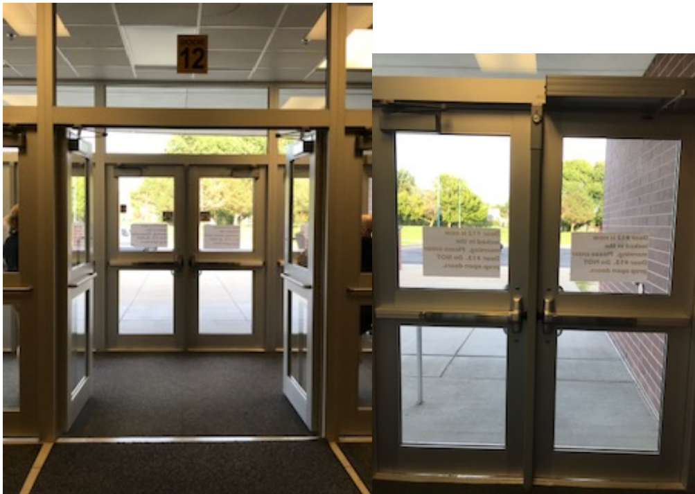
Exit Doors – center bar will be removed Height - 84" Width - 64"

The above information is being provided to you in order give you the most complete information we currently have on this contest. All information is subject to change either before or during the event by contest personnel based on need.