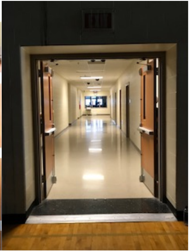
Auxiliary Gym Entrance/Exit Height - 84" Width - 62"

The above information is being provided to you in order give you the most complete information we currently have on this contest. All information is subject to change either before or during the event by contest personnel based on need.