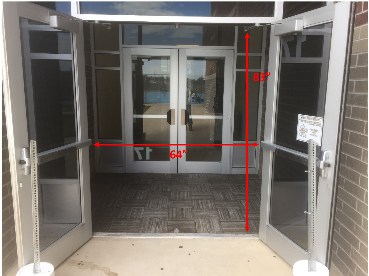
Door #1 – Exterior to Vestibule