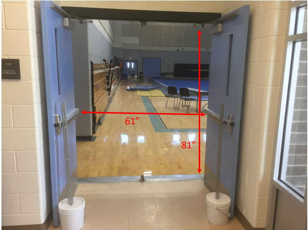
Door #3 – Hallway to Aux. Gym