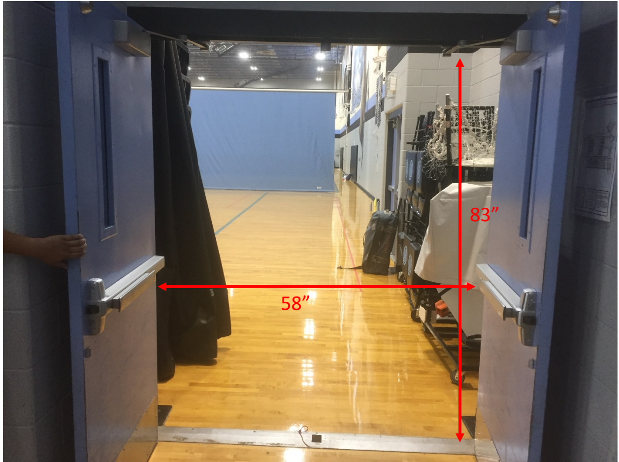
Door #4 – Aux. Gym to Performance Gym