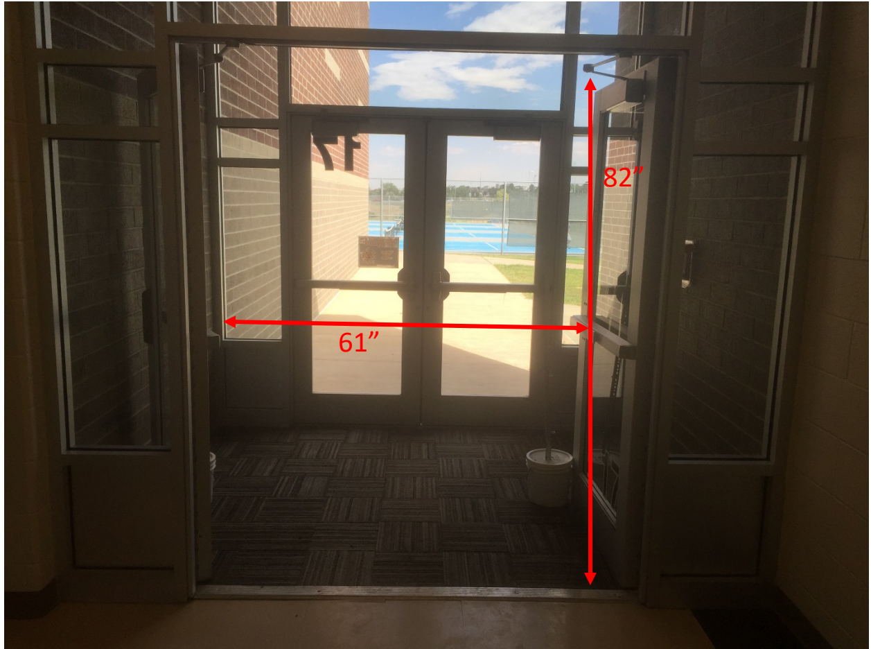
Door #2 – Vestibule to Hallway