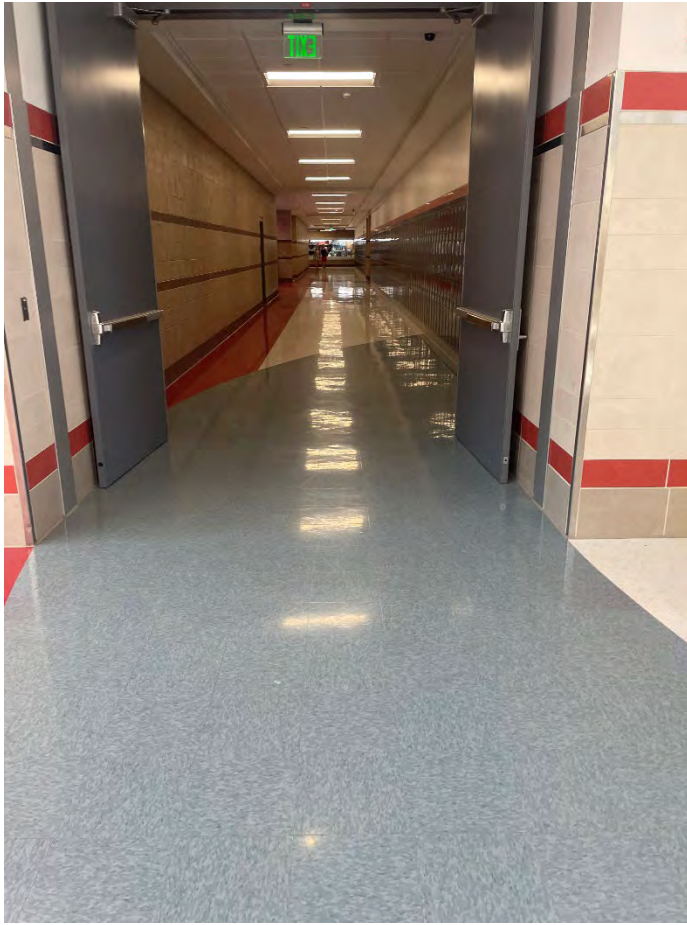
Hallway: Width 5ft 7 inches, Height 9ft

The above information is being provided to you in order give you the most complete information we currently have on this contest. All information is subject to change either before or during the event by contest personnel based on need.