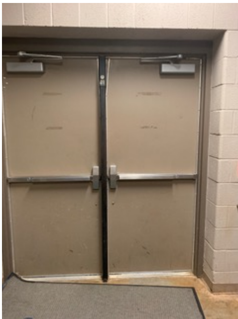
Second gym entrance for floor/prop 67" and 82" tall- All Center Bars Removable

The above information is being provided to you in order give you the most complete information we currently have on this contest. All information is subject to change either before or during the event by contest personnel based on need.