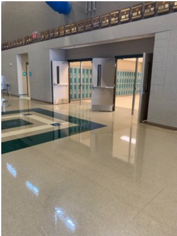
Rain plan hallway directly outside gym door– All Center Bars Removable