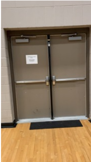
Gym exit door for floor/prop and performers 64" and 82" wide- All Center Bars Removable