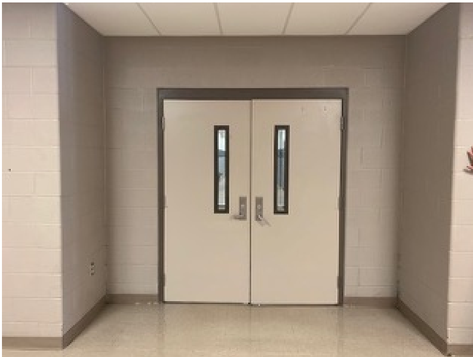
Floor/prop holding hallway door and beginning of performance entrance – All Center Bars Removable 65" wide and 82" tall

The above information is being provided to you in order give you the most complete information we currently have on this contest. All information is subject to change either before or during the event by contest personnel based on need.