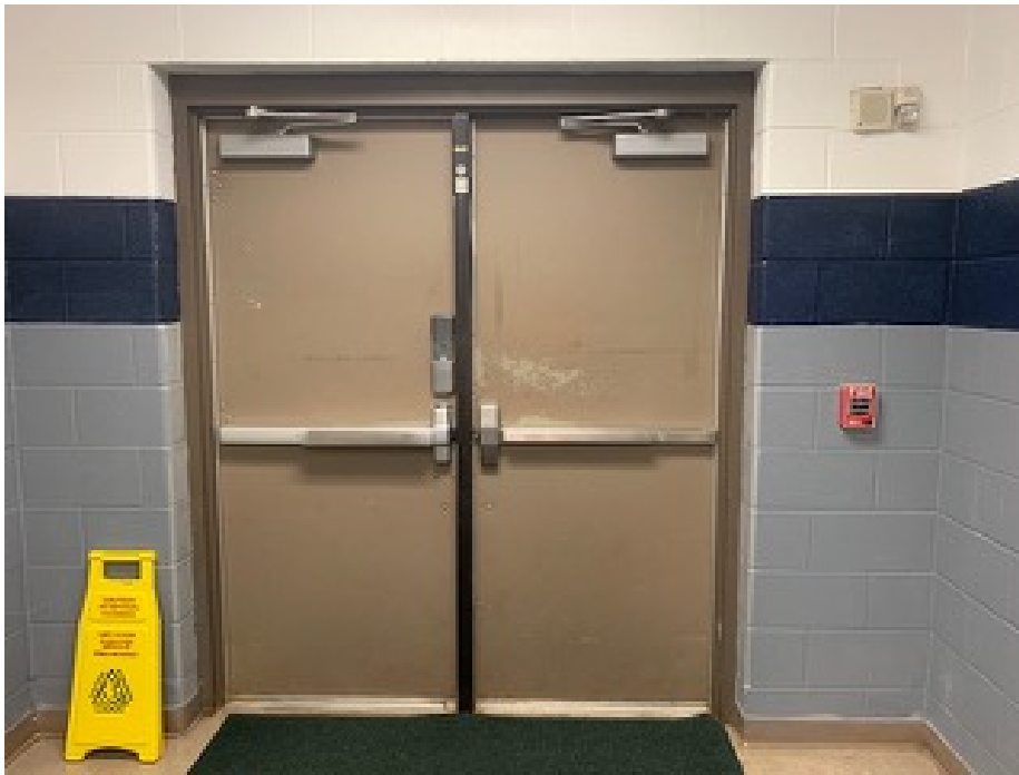
Doorway from floor/prop storage to gym entrance 67" wide and 82" tall- All Center Bars Removable