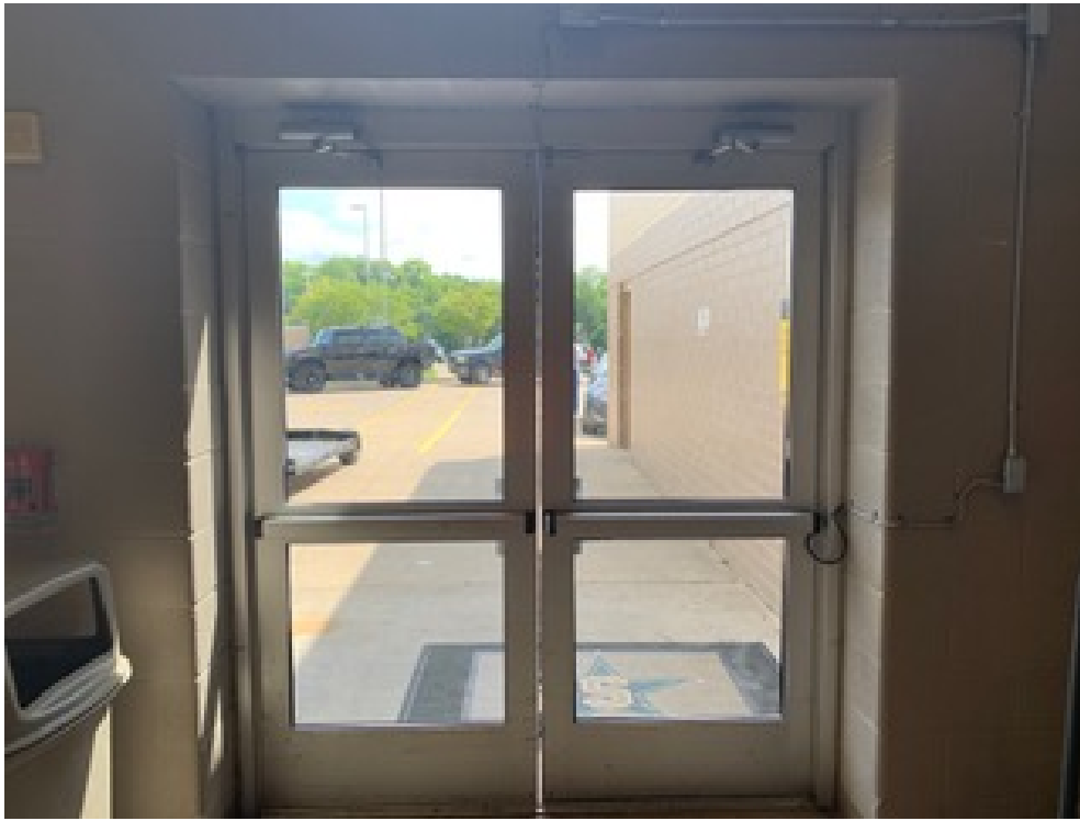
Load and unload door for props/floor 61" wide and 81 1/2" tall