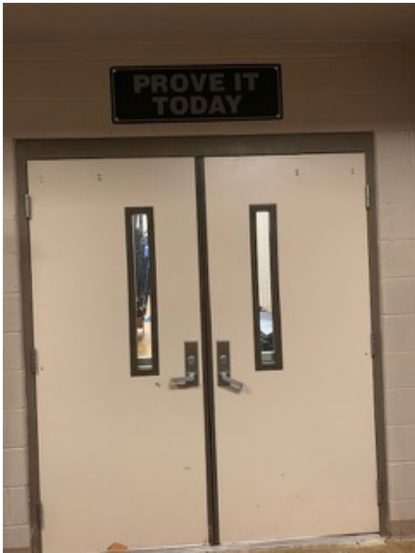
Final gym entrance for floor/ prop and performers entrance 67" and 82" wide- All Center Bars Removable