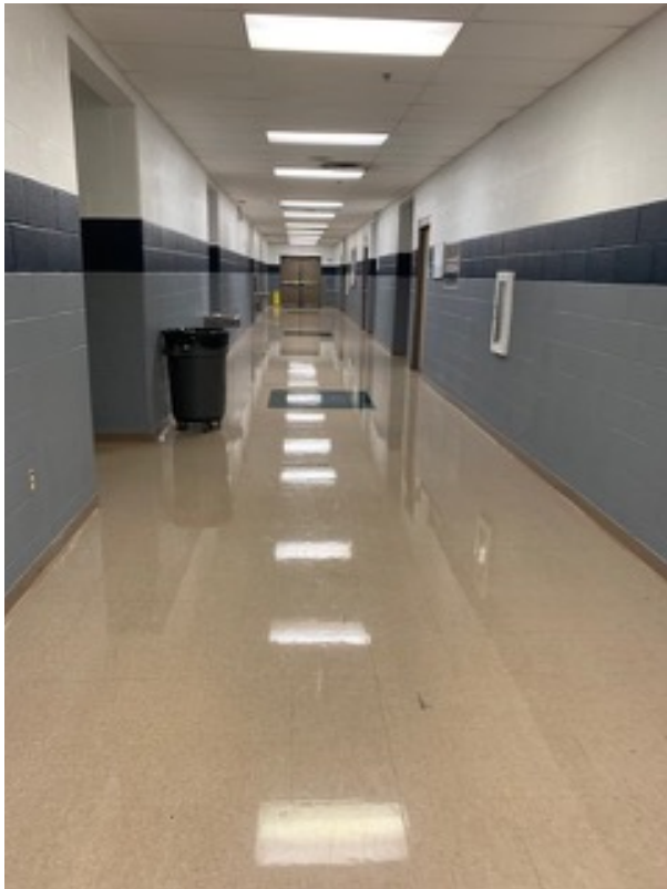
Storage hallway for floor/prop

The above information is being provided to you in order give you the most complete information we currently have on this contest. All information is subject to change either before or during the event by contest personnel based on need.