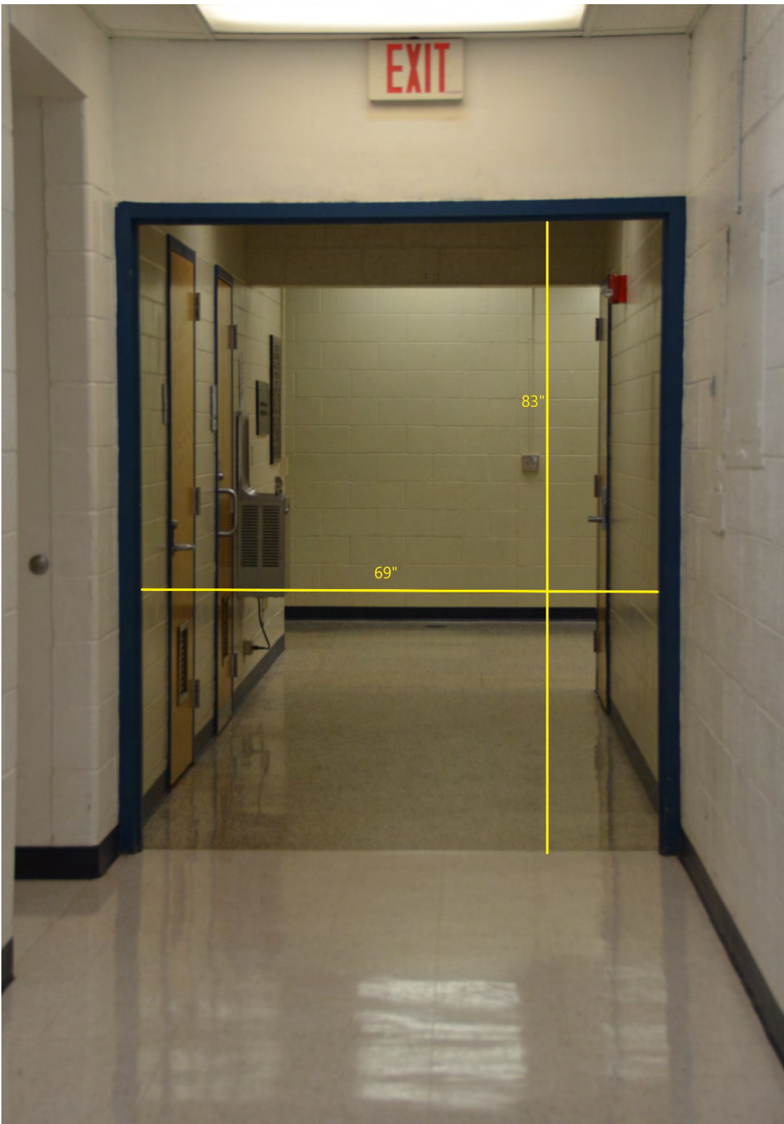
Prop Hallway 1

The above information is being provided to you in order give you the most complete information we currently have on this contest. All information is subject to change either before or during the event by contest personnel based on need.