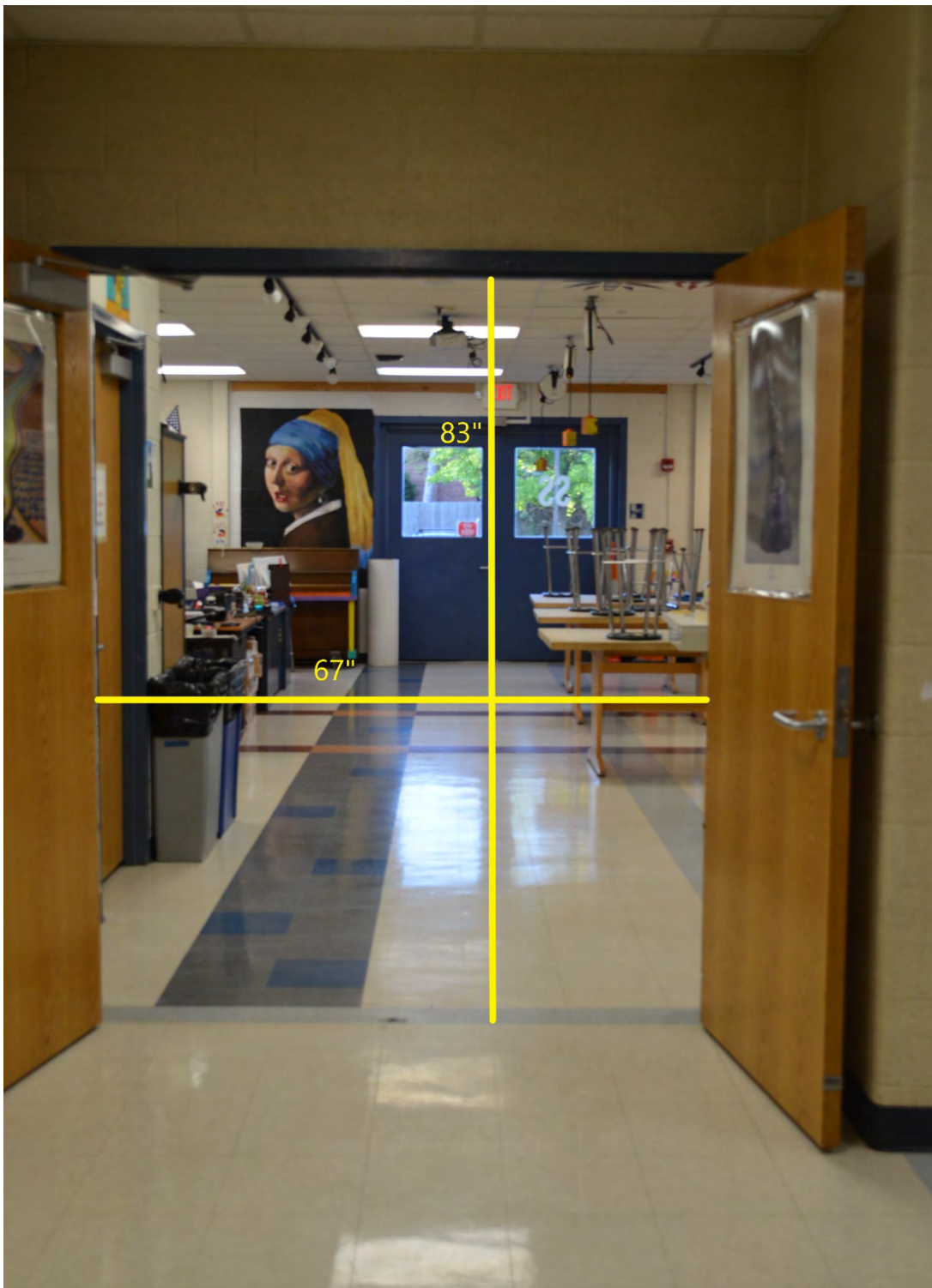
Alternate Prop Room Doorway

The above information is being provided to you in order give you the most complete information we currently have on this contest. All information is subject to change either before or during the event by contest personnel based on need.