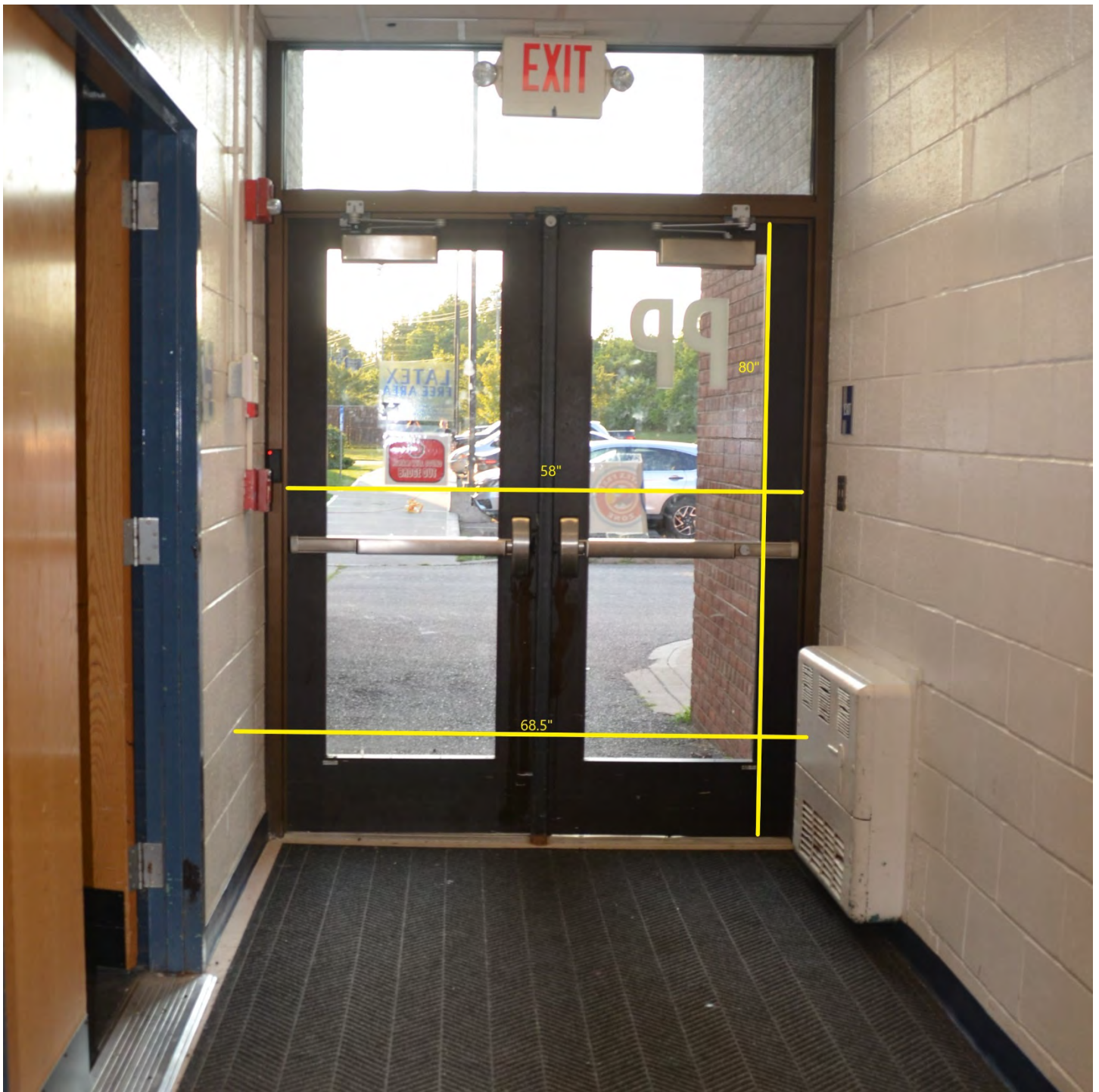
Main Prop Entrance Center Bar will be removed

The above information is being provided to you in order give you the most complete information we currently have on this contest. All information is subject to change either before or during the event by contest personnel based on need.