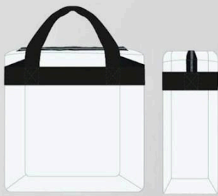
12" x 6" x 12" Clear Plastic Bag