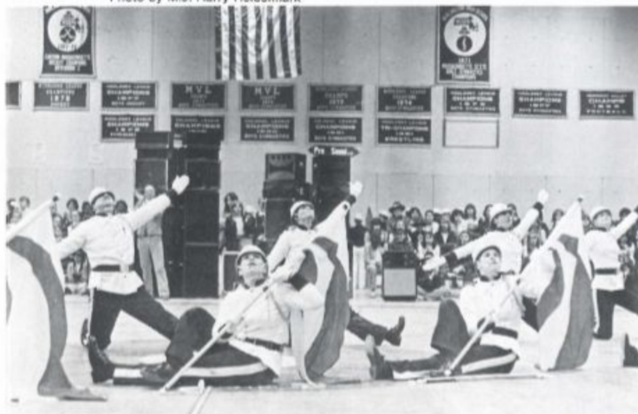
NY Royal Guardsmen Eastern Champions Open Class