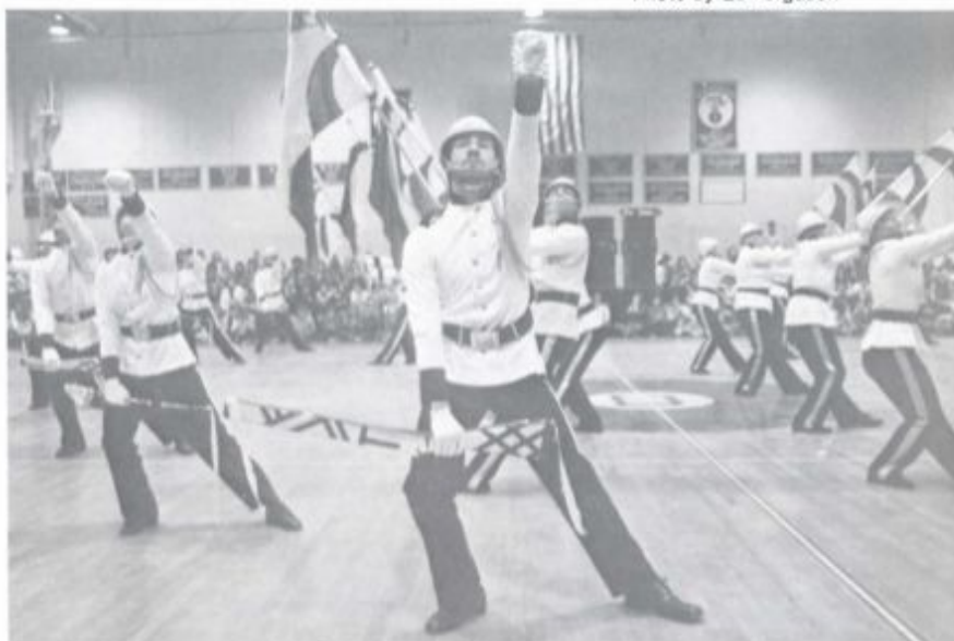
NY Royal Guardsmen Eastern Seaboard Champions Open Class