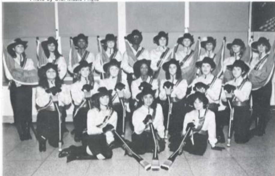
Elizabeth HS Eastern Champions Class A