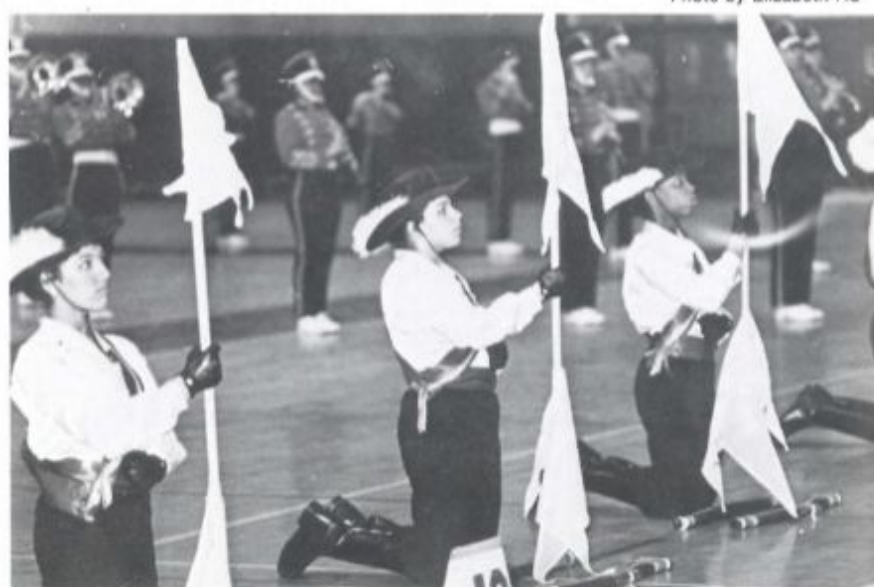
Elizabeth HS Eastern Seaboard Champions Class A