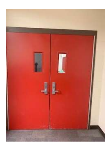
Entry Doors into Equipment Warmup