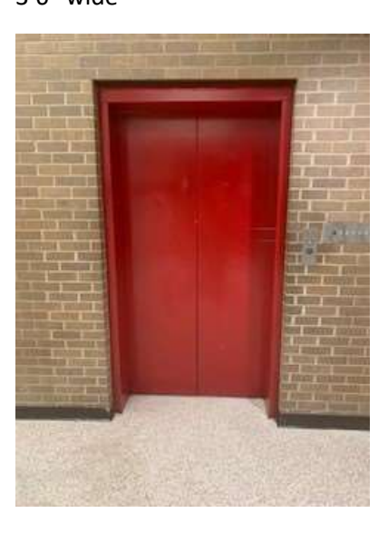
1st Set of Exit Doors from UHS Facility