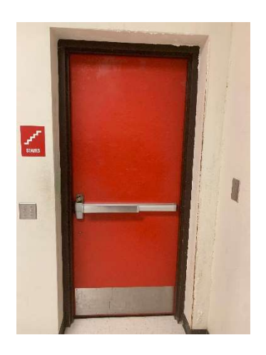
1<sup>st</sup> Set of Exit Doors from Body Warm Up