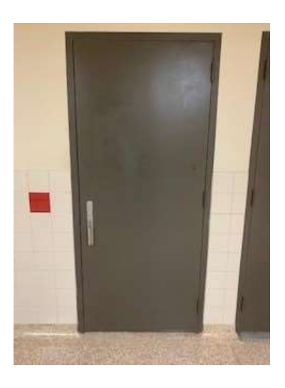
Exit Door to Stairwell Leading to Body Warmup