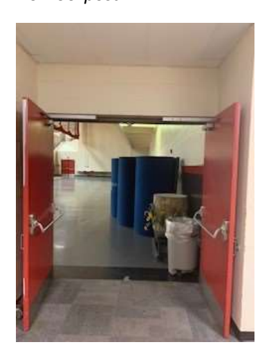
Exit Doors from Equipment Warmup