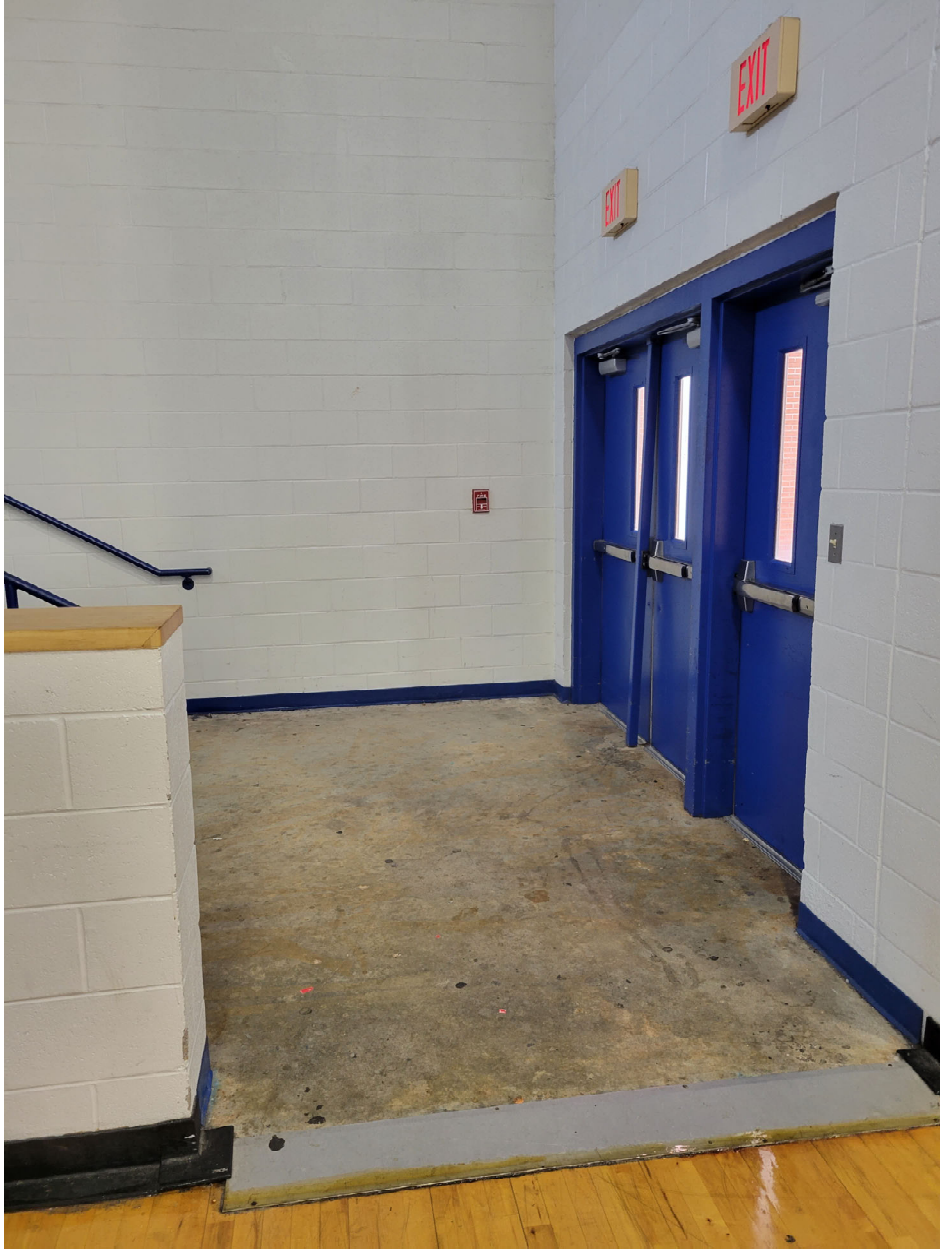
Performance Entrance and Exit tight turn

width is 72" and the length is 156" from outside corner and 97" from inside corner.