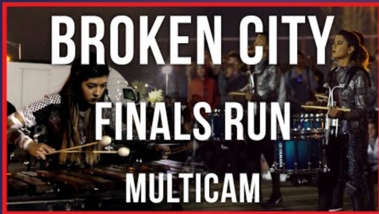
2019 Broken City "Cede Ili"