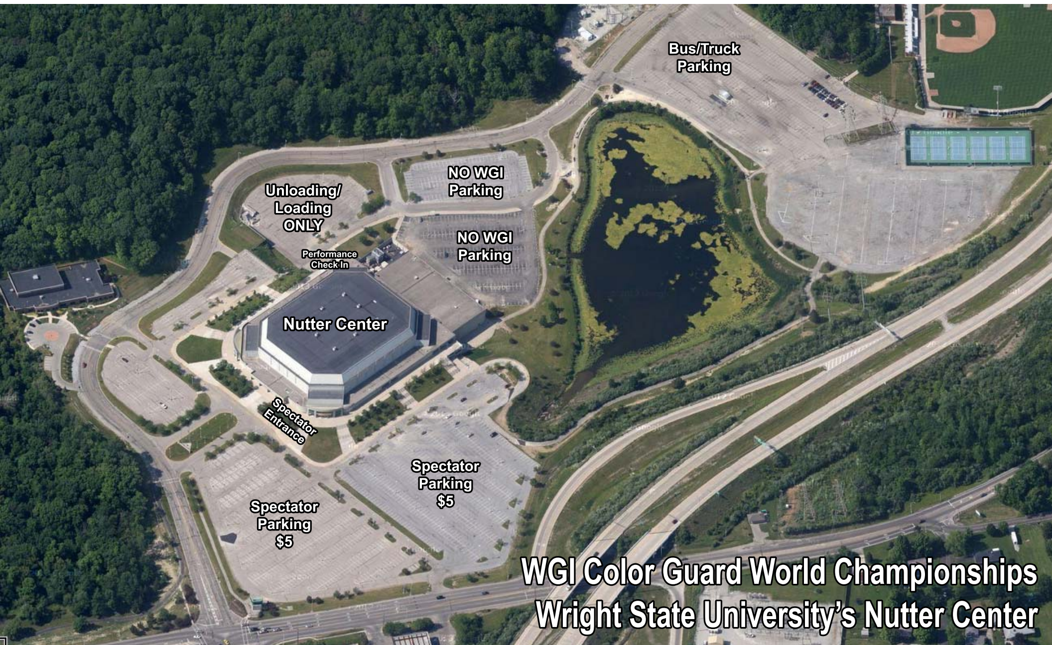
WGI Color Guard World Championships Wright State University's Nutter Center